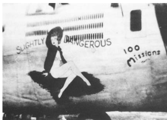
#333 became another 531st centenarian with its return from Taihoku