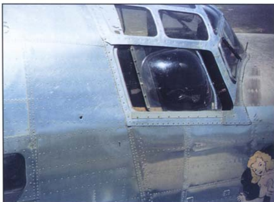
Looking at the co-pilot's side of #189 Embarrassed.