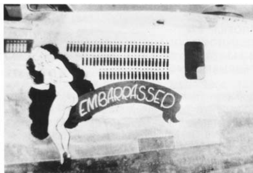
A closer view of the artwork on #189. For a post war comparison of the other side, see page 406. James Murtaugh Collection

Source: Horton, Best in the Southwest , p. 490.