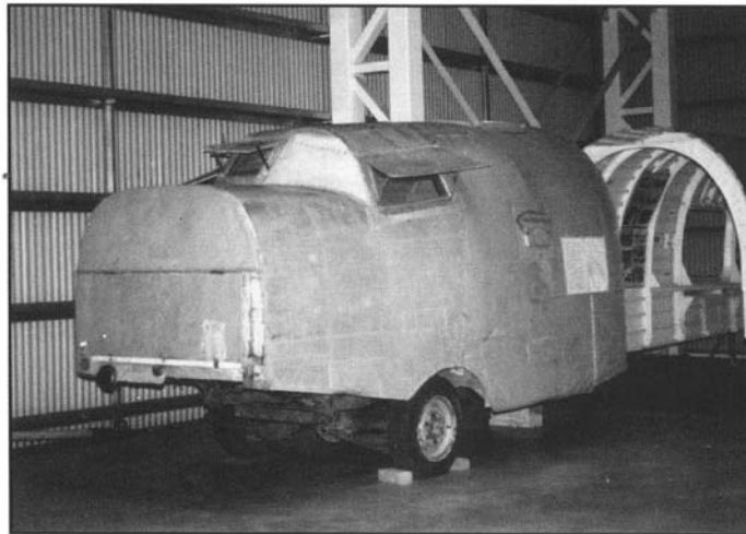
The caravan made from the cockpit section of 42-41182 in the Northern Territory Aviation Museum. Most of the bomb log can still be seen etched into the metal.