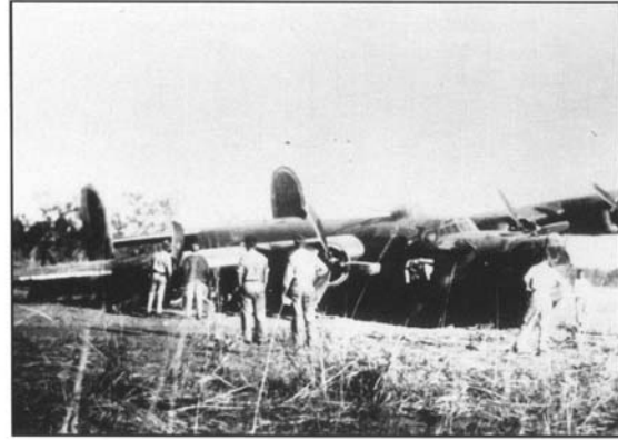
42-41182 after its accident at Long in 1944. What appears to be a motif under the cockpit is actually a shirt hung on the aerial array to conceal it for the camera. (via Bob Alford)

Source: Livingstone, Under the Southern Cross, p. 131.