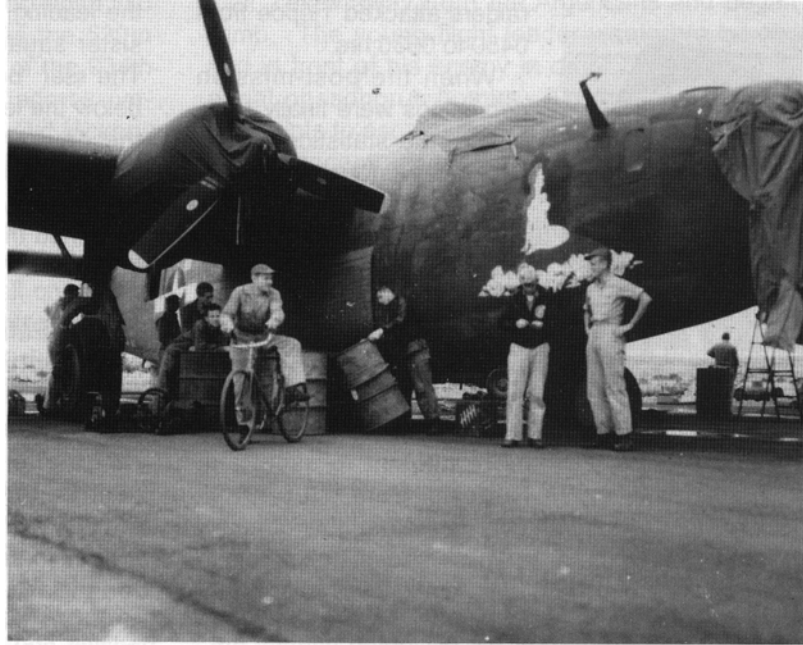
Taking a break while hand pumping the gasoline in each plane.