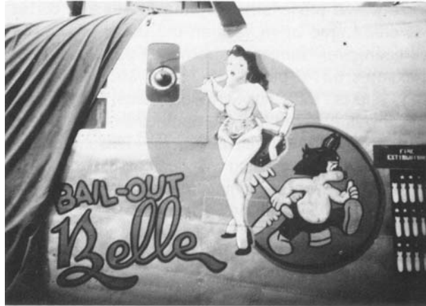
The other side of #951 showing the squadron logo incorporated into the artwork, the only such case recorded in the Group. Compare this with the photo on page 253. Robert Chandler Collection

Source: Horton, Best in the Southwest, p. 254.