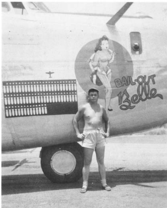
By July 1944, #951 Bail-Out Belle had been stripped of its OD paint. Note the new presentation of mission markers.