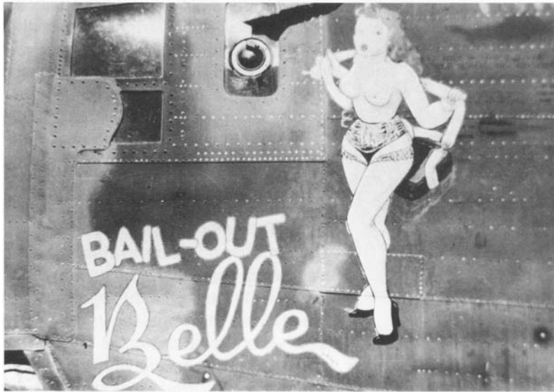
The venerable Belle flew 64 mission before being scrapped.