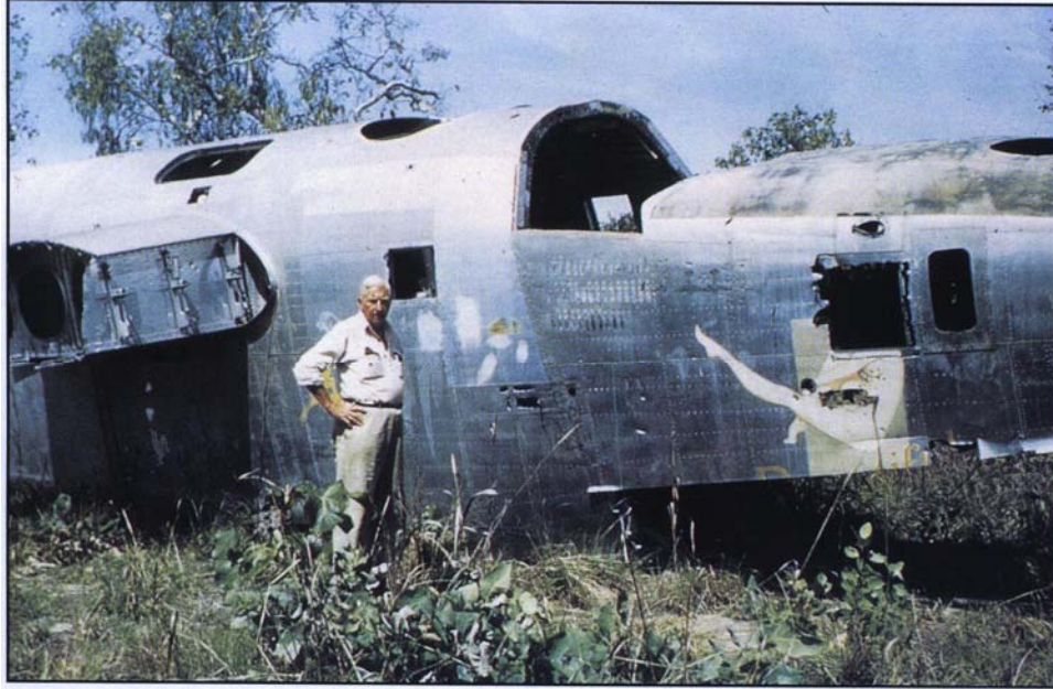
#167 Beautiful Beast lying derelict at Darwin in 1951.