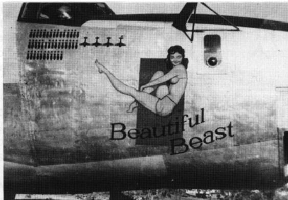
#167 Beautiful Beast some time later showing April 23rd kills.