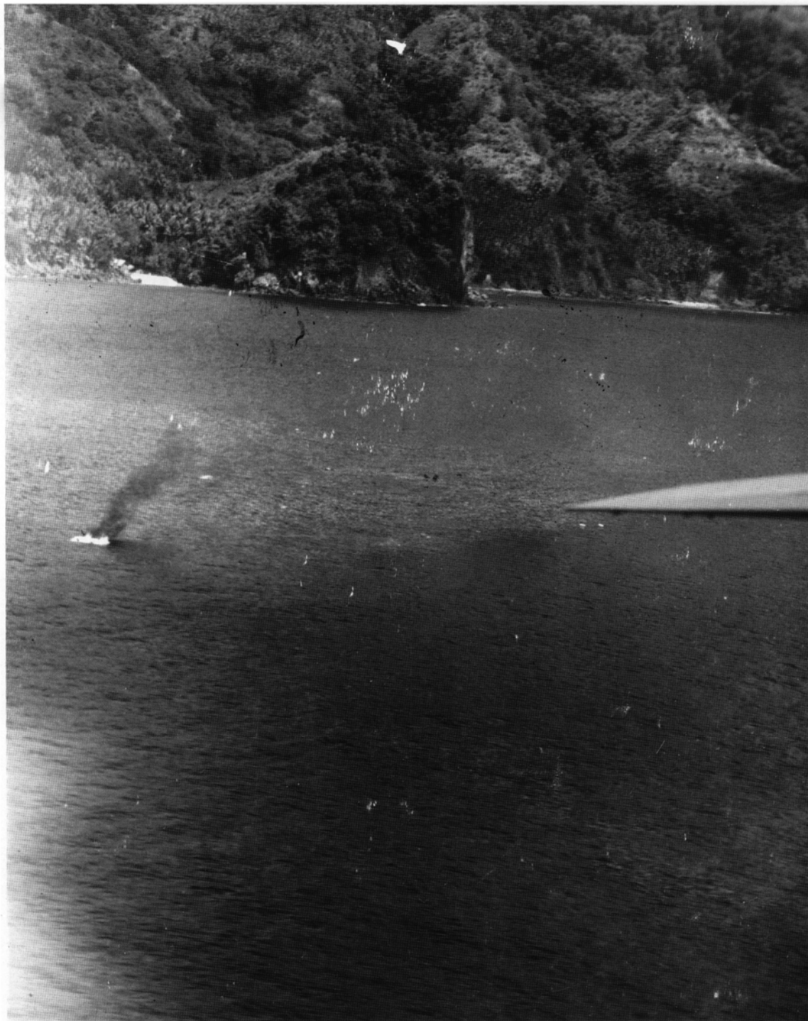
A burning oil slick just off the coast of Serua island marks the grave of #117 Doodlebug . This photo of the January 19th shutdown is sadly representative of the high losses suffered by the 380th during the first month of 1944.