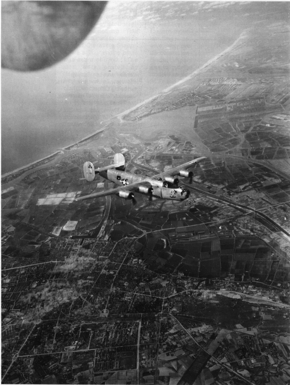
#488 Ready Teddy over Tainan, Formosa on 20 Mar. 1945. Previously, the plane had been named Eh, What's Up Doc?