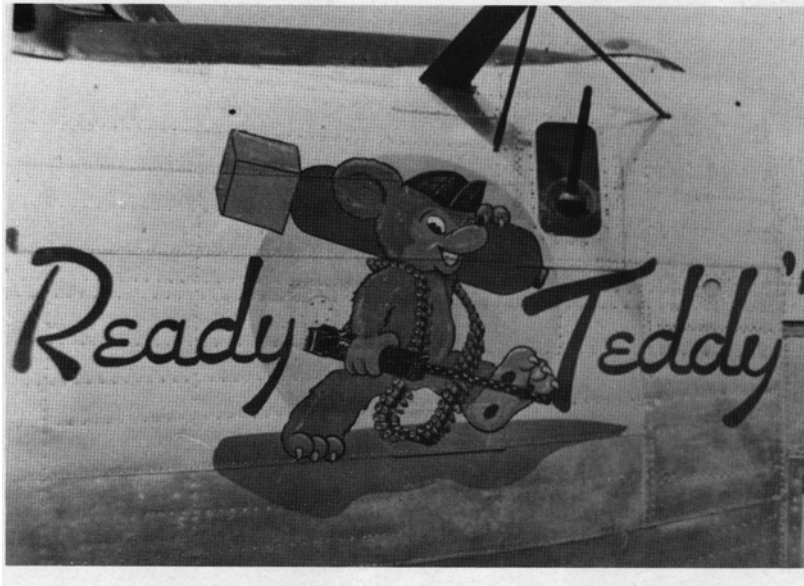
#488 Ready Teddy was originally named Eh, What's Up Doc ?