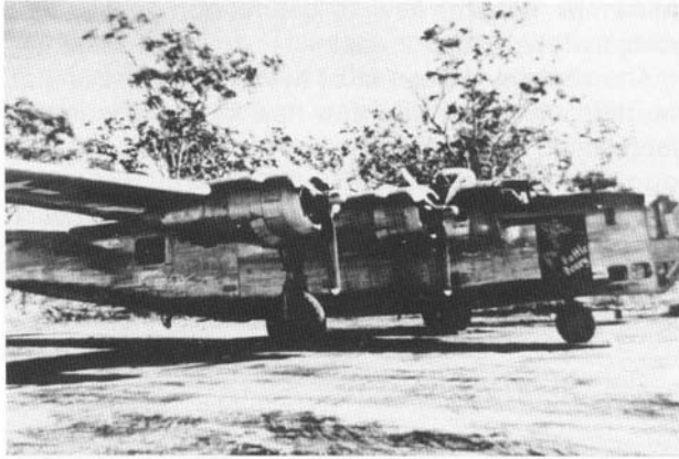
#243 Battle Weary without national insignia on its fuselage but under its right wing. Also, the large Oklahoma City serial number has been reduced to fit into the tail quadrant markings.