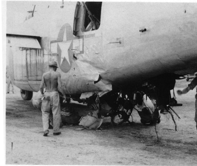
The gutted out belly of #340 First Nighter being examined by amazed 529th maintenance men.