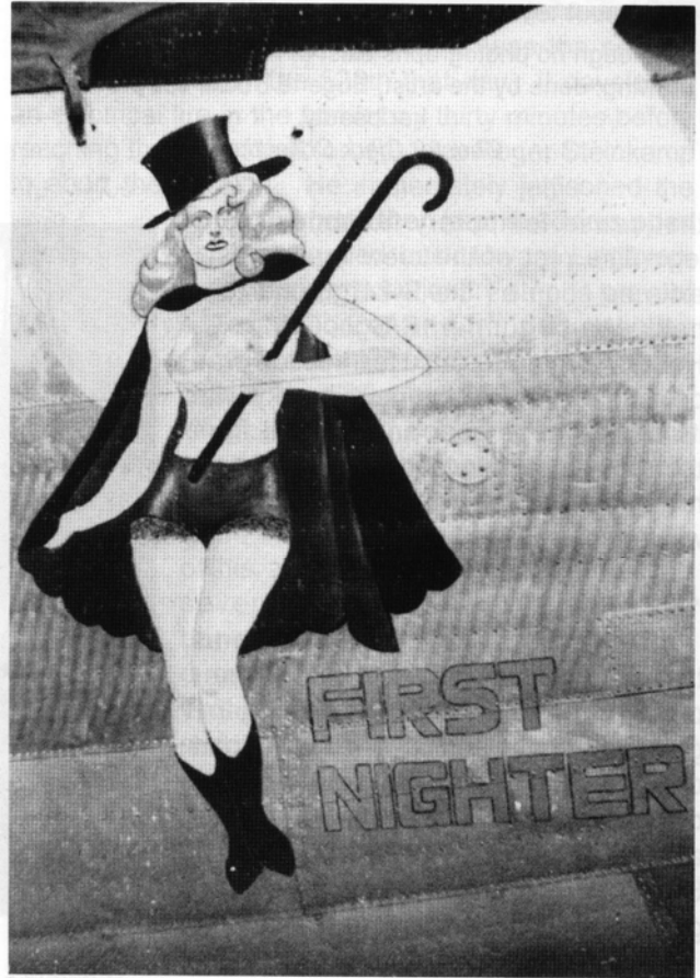
Notice the vertical scuff marks left when the OD paint scheme was removed from #340 First Nighter .