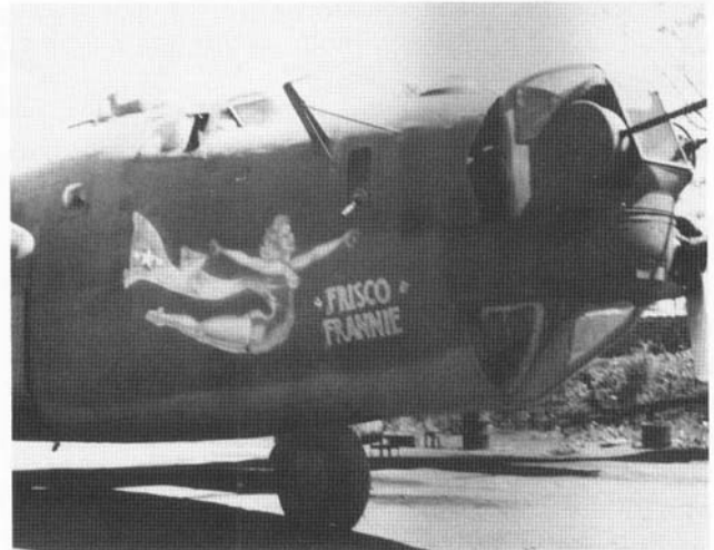
The 530th's #451 Frisko Frannie with an A6A turret, braced pitots, gun sockets to the navigator's side windows and no extra windows for the bombardier.