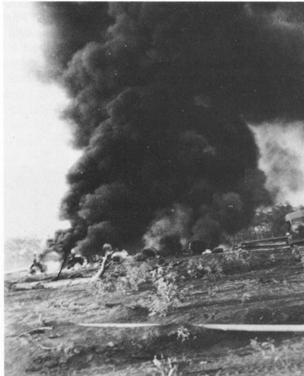
#125 Gus' Bus II burned furiously after crashing at Darwin.