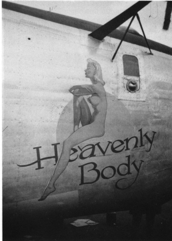
Although lucky on 18 Sept. 44, #116 Heavenly Body would be lost in March 1945.