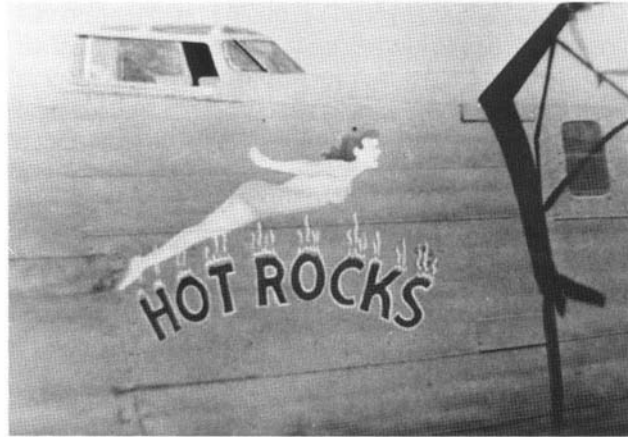
#489 Hot Rocks would eventually become The Sultan's Daughter.