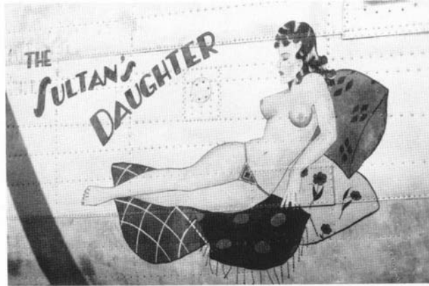
A good look at the variety of pillows beneath the woman adorning #489.