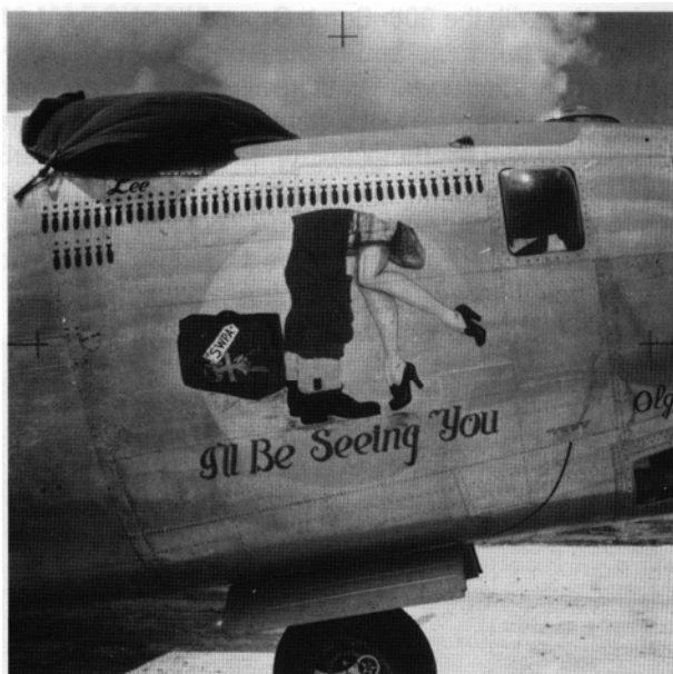
Another lucky ship, #923 landed safely on 28 Mar. 1945.