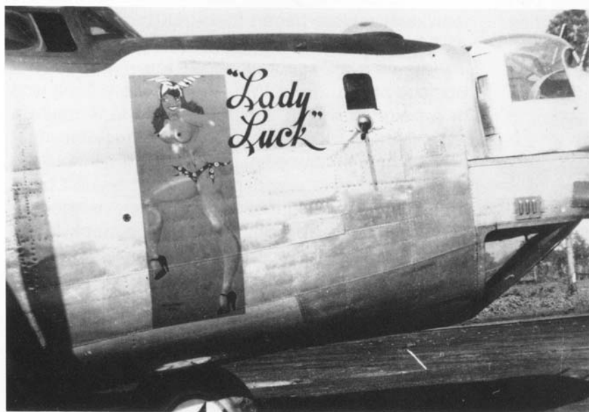
#0116 Lady Luck proved to be as good as her name and flew at least 90 missions before the end of the war. It was flown back to CONUS for salvage at Kingman, Arizona.

Source: Horton, Best in the Southwest, p. 282.