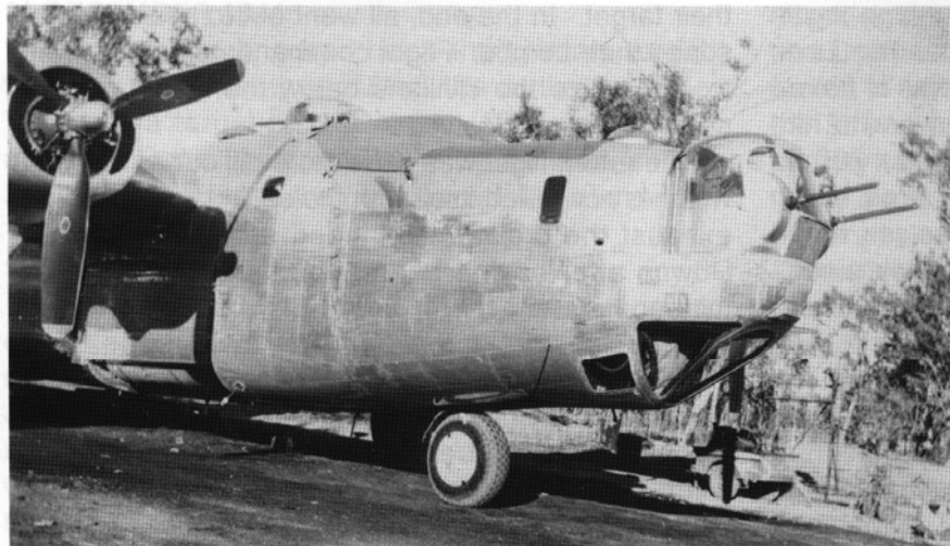
Between missions at Darwin. Note the variations in this "J" model B-24: A6B hydraulic nose turret, the lack of a pitot tube on the right side and the bombardier side windows.