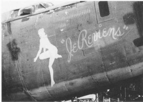
#808 Je Reviens would prove to be a lucky ship within the 529th and eventually fly 58 missions and claim 7 fighters.