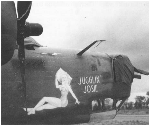
42-41237 Jugglin' Josie a new addition to the 530th. Note this Oklahoma City modified B-24 has extra side windows to the bombardier's area that give it a distinct "chin."