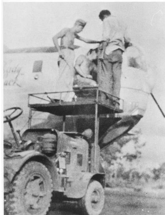
Armament men working on the nose turret of the 528th plane LADY LUCK 42-110116.