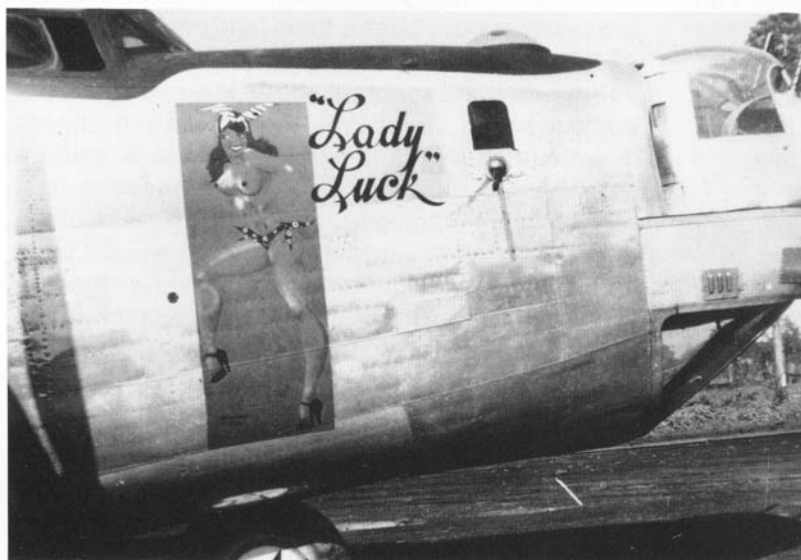
#0116 Lady Luck proved to be as good as her name and flew at least 90 missions before the end of the war. It was flown back to CONUS for salvage at Kingman, Arizona.

Source: Horton/Horton, King of the Heavies , p. 103.