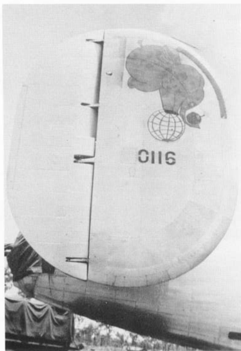
The 528th's pink elephant on 42-110116 Lady Luck.