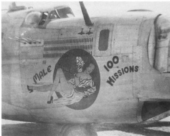
#799 Male Call, the first plane in the 531st to make the coveted century mission mark. The name came from a Milton Caniff cartoon strip.