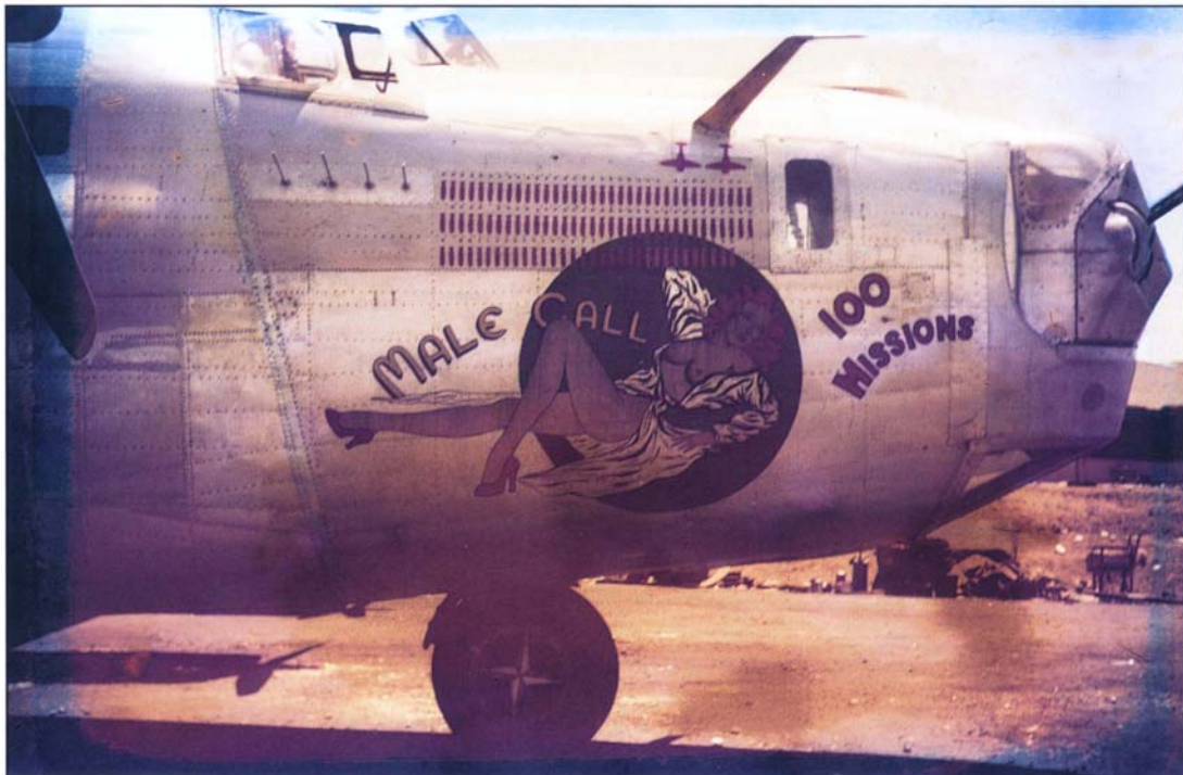
#799 Male Call shortly after completing its 100th mission.