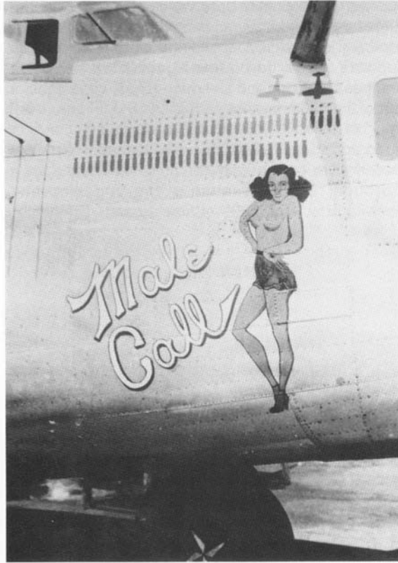
Male Call sporting its two kills several months after the fight.