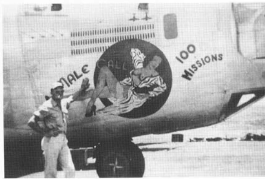
#799 Male Call shortly before being sent for salvage.