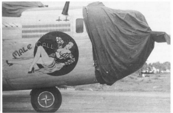
#799 just before being sent to Biak for salvage.