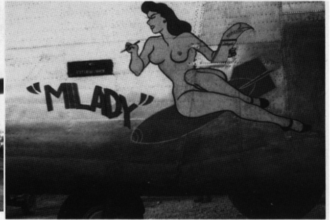
#134 Milady, stripped of its OD paint scheme.