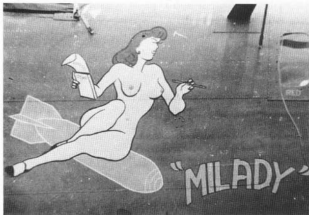
The right side of #134 Milady showing 3 mission markers and the names "Monie" and "Red".