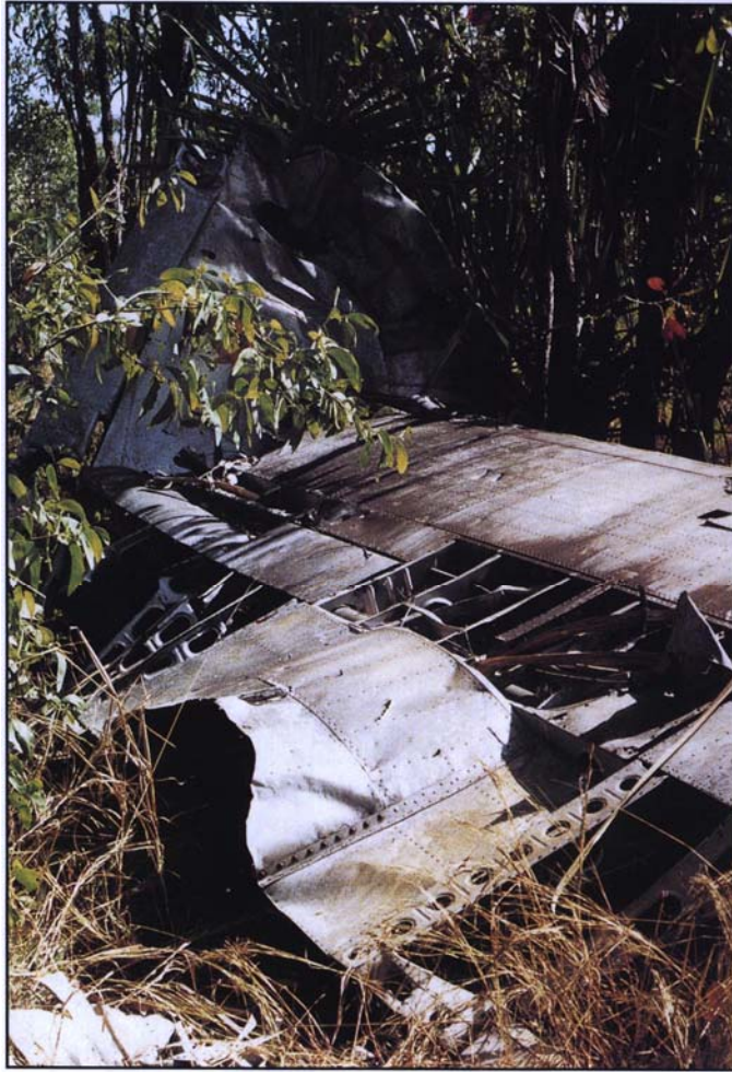
Tail section wreckage of #134 Milady still lying where it crashed near Darwin, January 1945.