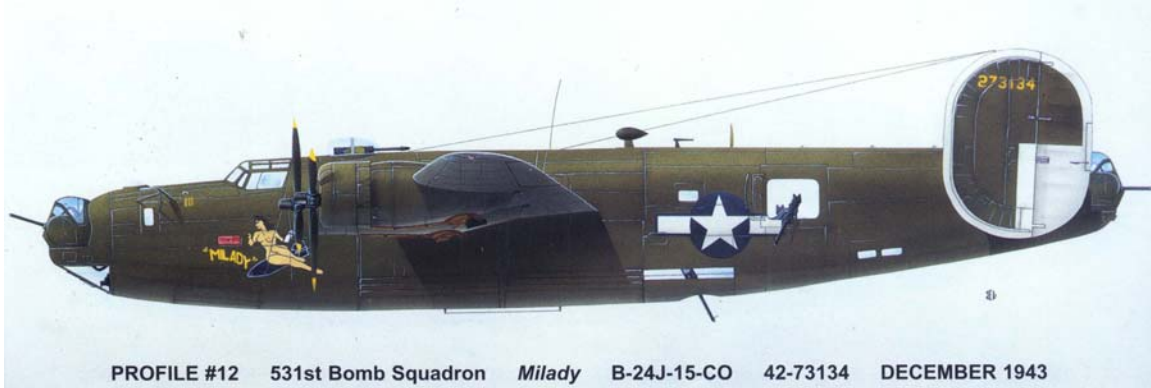
PROFILE #12 531st Bomb Squadron Milady B-24J-15-CO 42-73134 DECEMBER 1943