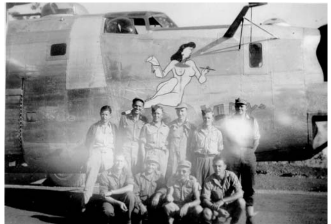
Cunningham Crew