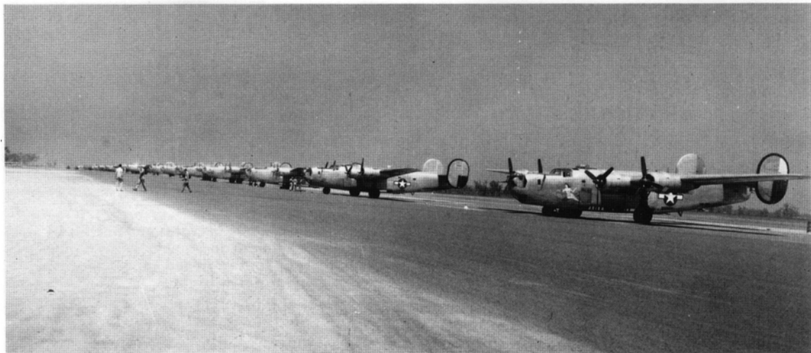
The 531st flight line at Darwin. #134 Milady is closest to the photographer.