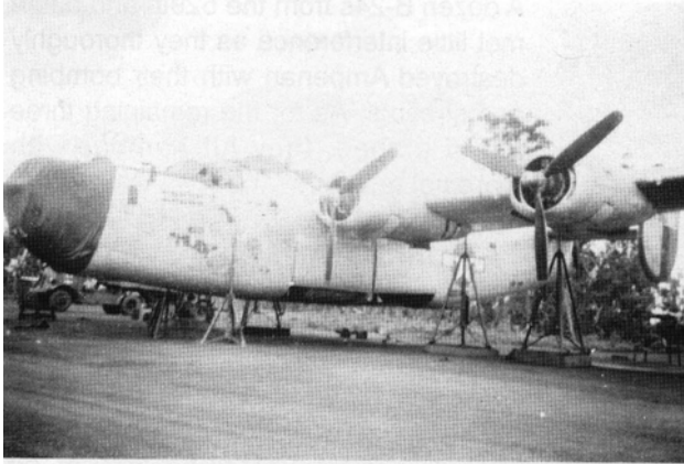
#134 Milady up on jacks for some landing gear work.