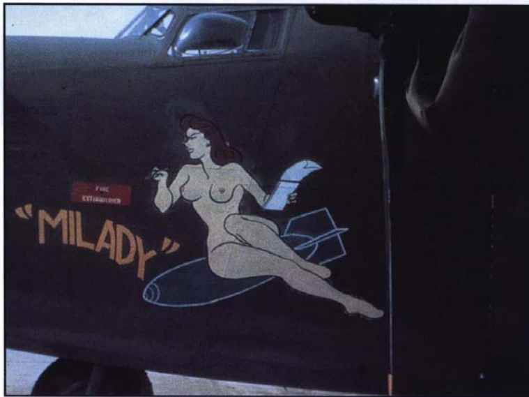
#134 Milady at Fairfield-Susin before going overseas.