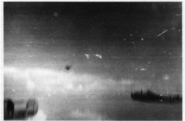
A shaky picture taken by a nervous gunner as the Zeke came through the 529th formation, 17 July 1944.