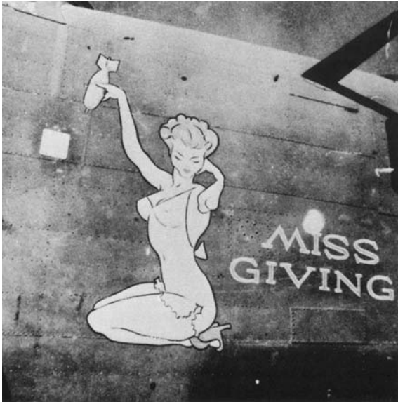
Sources: Horton, Best in the Southwest , p. 469; Horton/Horton, King of the Heavies , p. 39.