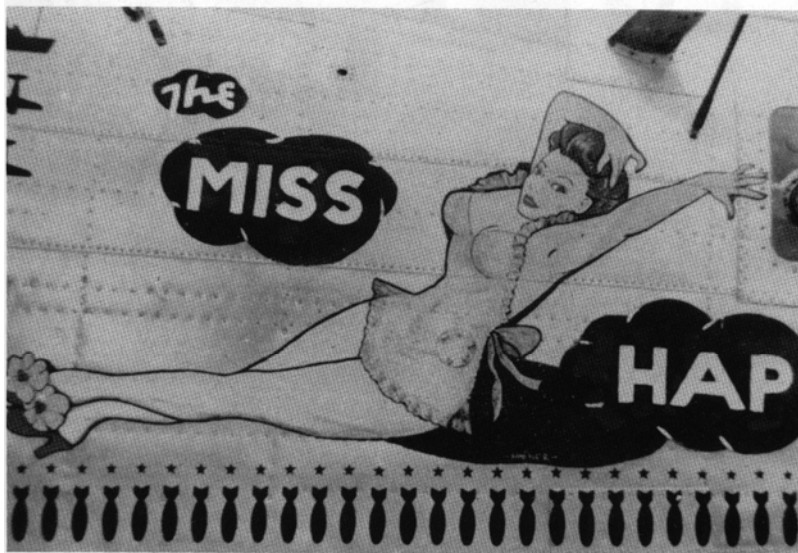
#221 The Miss Hap shot up with the Wehrly crew on 19 Mar. 1945 over Tainan. Compare this photo with the one on page 250 that showed the aircraft with an OD paint scheme.