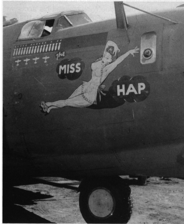
#221 The Miss Hap would eventually fly 80 missions before being scrapped on Biak.