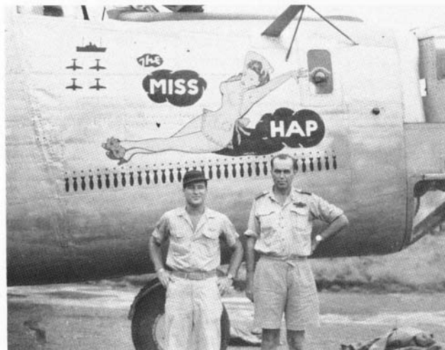
Two unidentified men standing beside #221 after it had the OD paint stripped off.