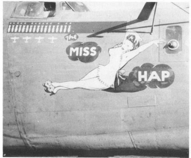
#221 The Miss Hap got all 4 of its kills on its 10th and 11th missions during the Geelvink Bay campaign.