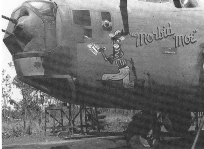
Left Side Before Stripping