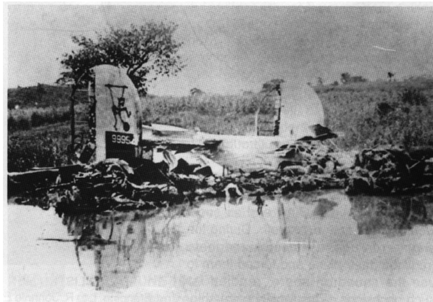
All that was left of On De-Fense. Notice it has both the old and new tail markings.