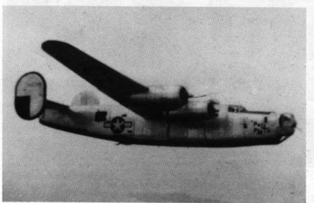
#398 Patty's Pig shortly before its shootdown.