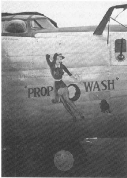
The venerable #475 Prop Wash.