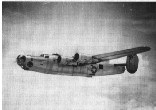
#432 Queen Hi complete with its squadron logo, mission tally and "Juggler" tail markings.