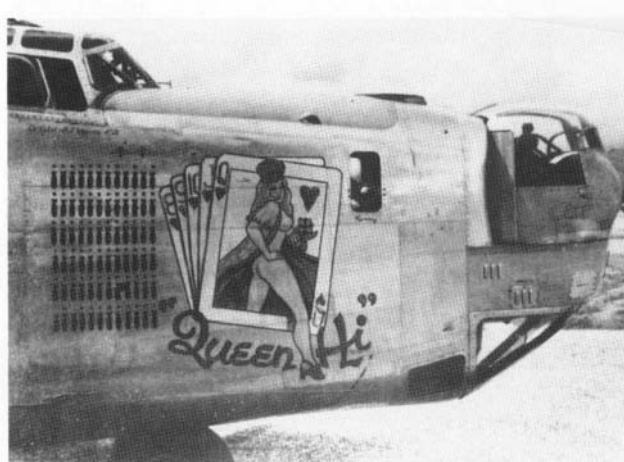
This 529th plane, #432 Queen Hi , nicely illustrates the lack of large pitots, A6B turret, gun sockets in the navigator windows and the bombardier side windows.