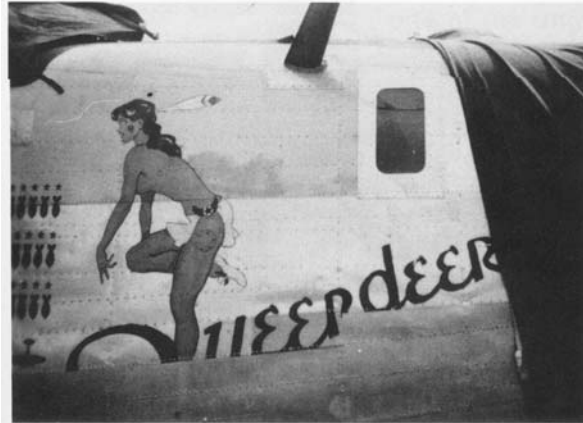
#935 Queer Deer showing extensive sheet metal work.