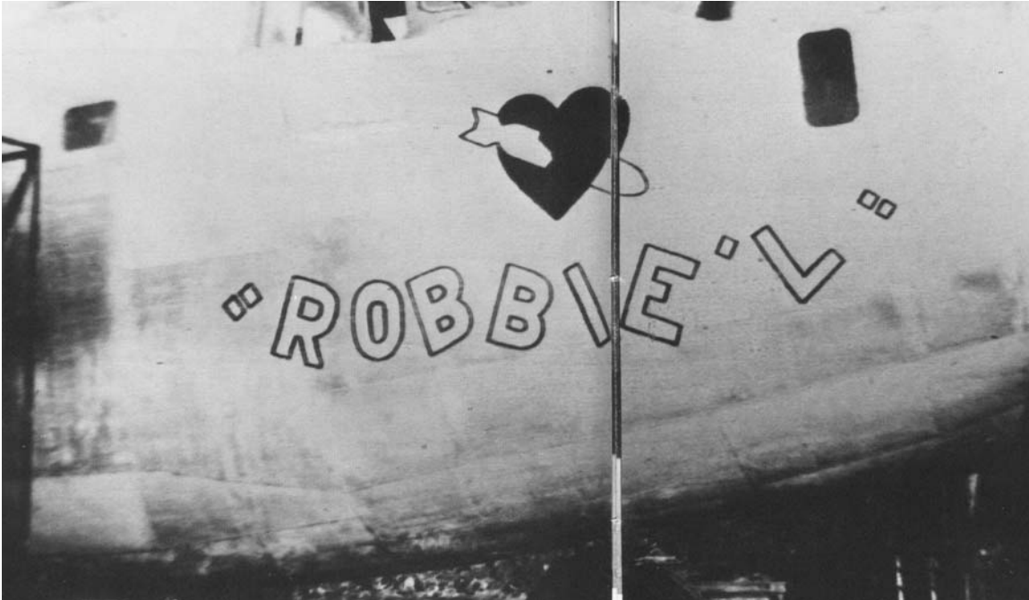
(Line in center is due to this picture being placed across two pages in the above-referenced book.)