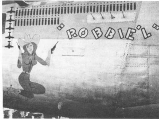
Kill markings after the April 30th battle.