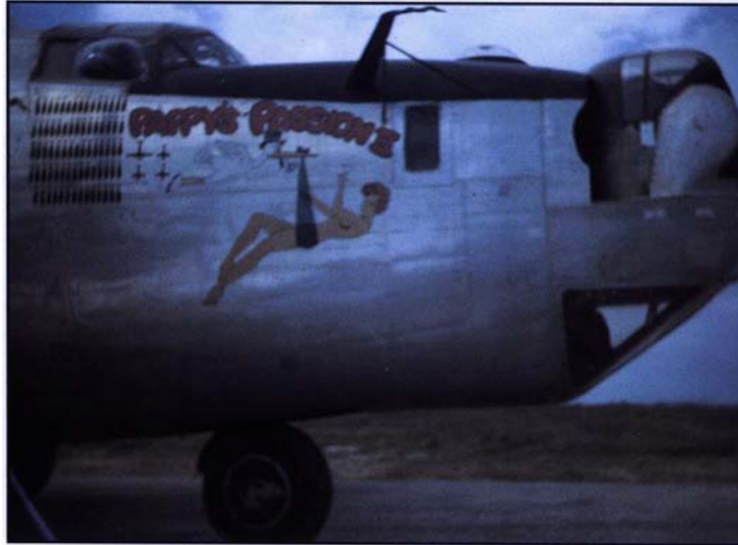
A long serving vet of the 531st, #121 Pappy's Passion II . Previously, it was named Royal Flush II .