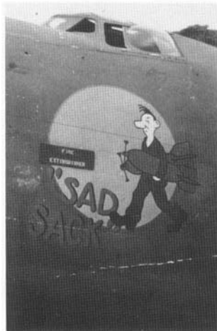
#133 Sad Sack before its OD paint was stripped.