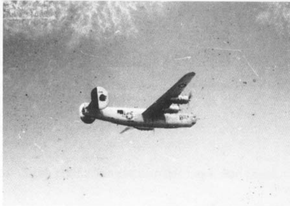
44-40189 Embarrassed displaying the lion and dark blue rudders of the 531st just before it returned to the States