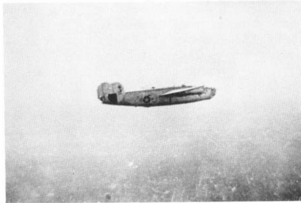
#189 Embarrassed with its dual tail markings Clarence Kramer Collection

Source: Horton, Best in the Southwest , p. 490.