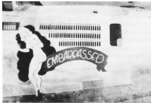
A closer view of the artwork on #189. For a post war comparison of the other side, see page 406. James Murtaugh Collection

Source: Horton, Best in the Southwest , p. 490.