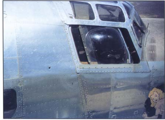
Looking at the co-pilot's side of #189 Embarrassed . T. K. Cornwall Collection

Source: Horton, Best in the Southwest, p. 385.