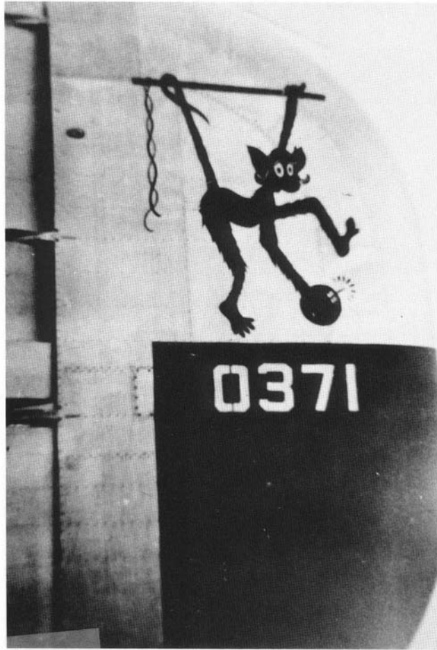
The 530th's new monkey combined with the old quadrant on 44-40371 Silver Lady .