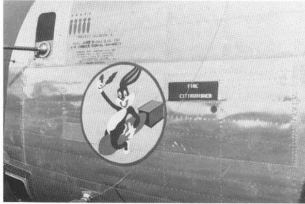
Bugs Bunny® on the 530th's 44-40371 Silver Lady.