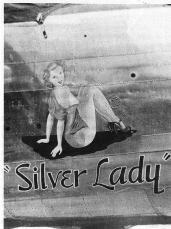
#371 attracted flak like a magnet but always brought her crew home safely.