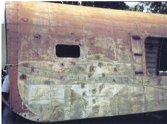
Fuselage on Display at the Darwin Air Museum