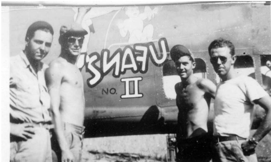
Note NO. for Number on this picture.