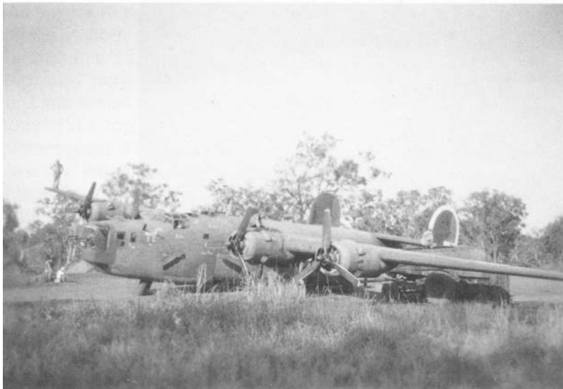
#225 Sunshine stuck in a soft taxiway at Long Strip. Note this plane is a "D" model with a Hawaiian Air Depot nose turret modification.