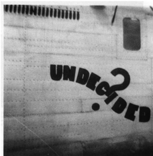
#333 would later be renamed Slightly Dangerous and fly 121 missions before being scrapped as War Weary.