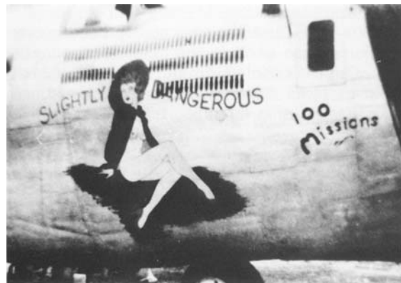
#333 became another 531st centenarian with its return from Taihoku