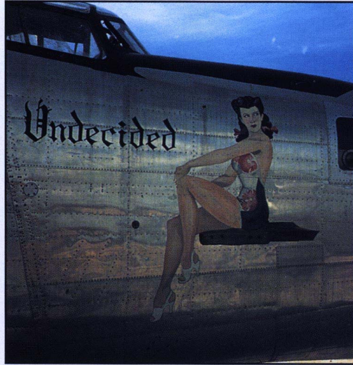
The 530th's #990 Undecided .