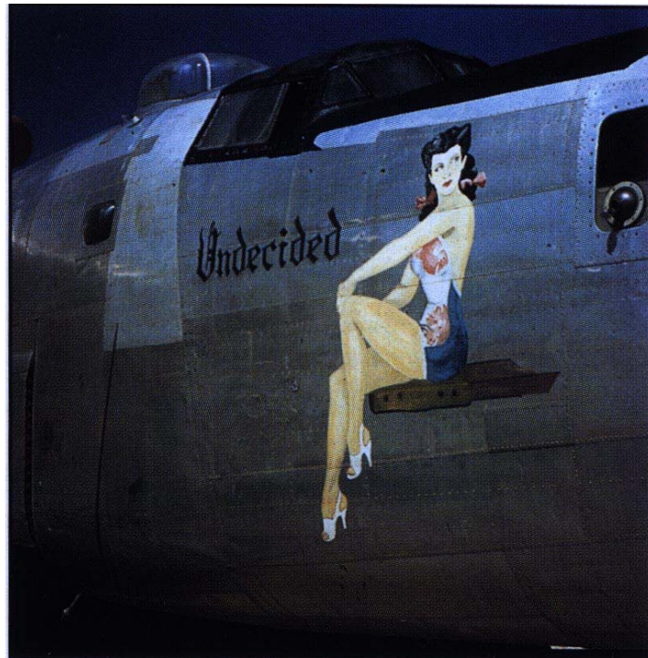
#990 Undecided of the 530th.