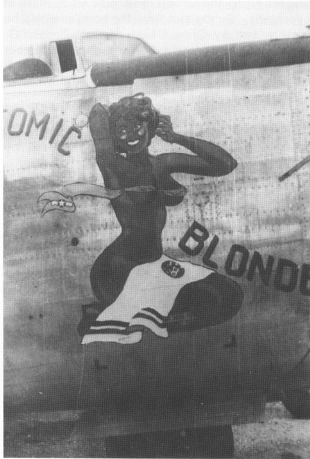
The 531st's #44-51414 Atomic Blonde with the new, "V" shaped windscreen to the canopy. Clarence Frankford Collection

Source: Horton, Best in the Southwest, p. 469.