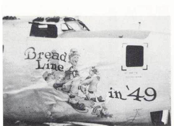
#201 of the 528th wrecked in a weather related, bad landing was scrapped at Yontan.