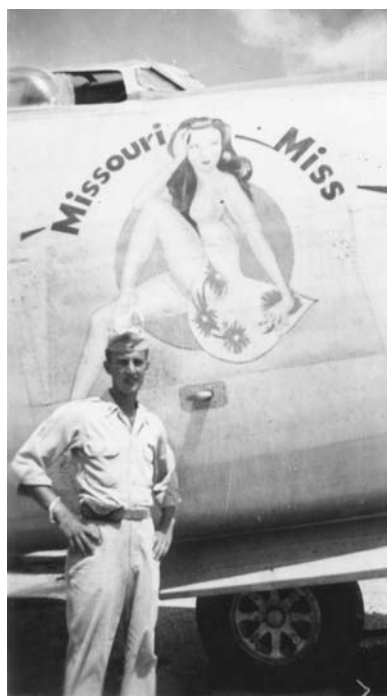
(his navigator is pictured here).