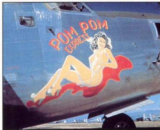
The 531st's Pom Pom Express, a late war B-24M-FO.