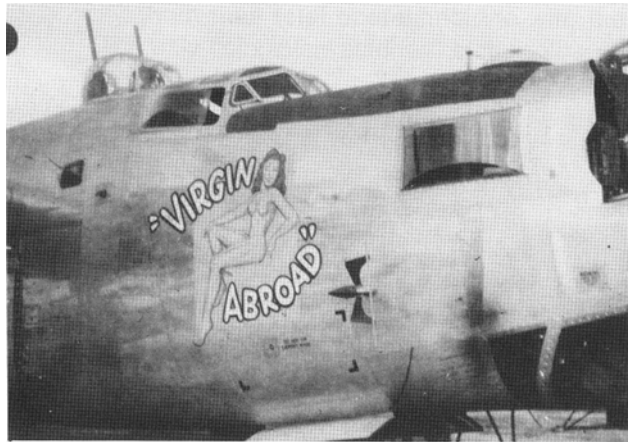
The 529th's #792 Virgin Abroad , a B-24M-10-FO from Willow Run showing the "high hat" top turret, elongated navigator side windows, triangular ones in the bombardier's compartment, Emerson nose turret plus a radar jamming antenna.