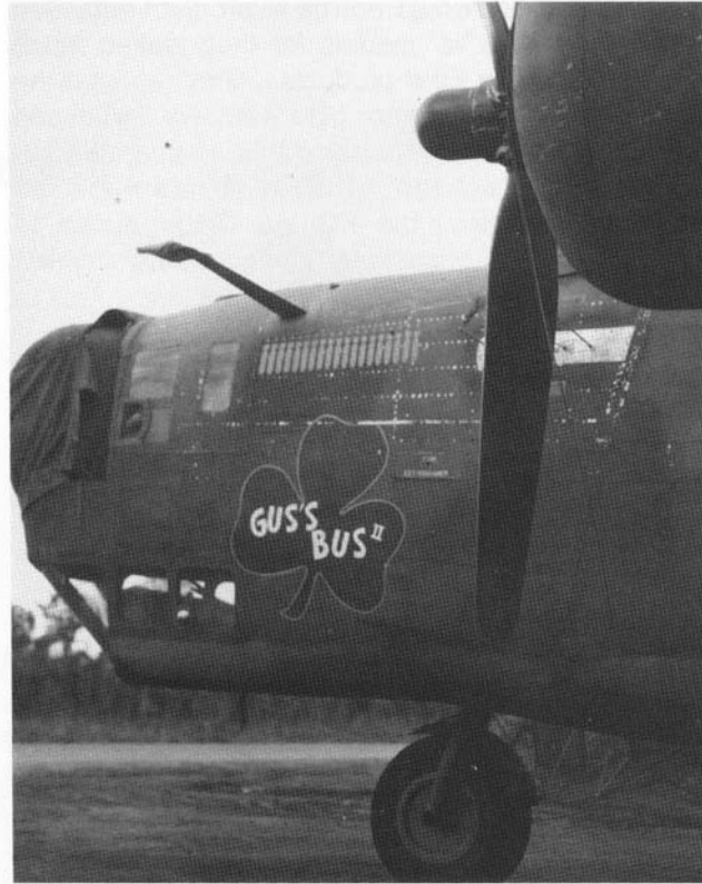
#125 Gus's Bus II nicely illustrating the Oklahoma City modification Ed Loy Collection

Source: Horton, Best in the Southwest , p. 467.