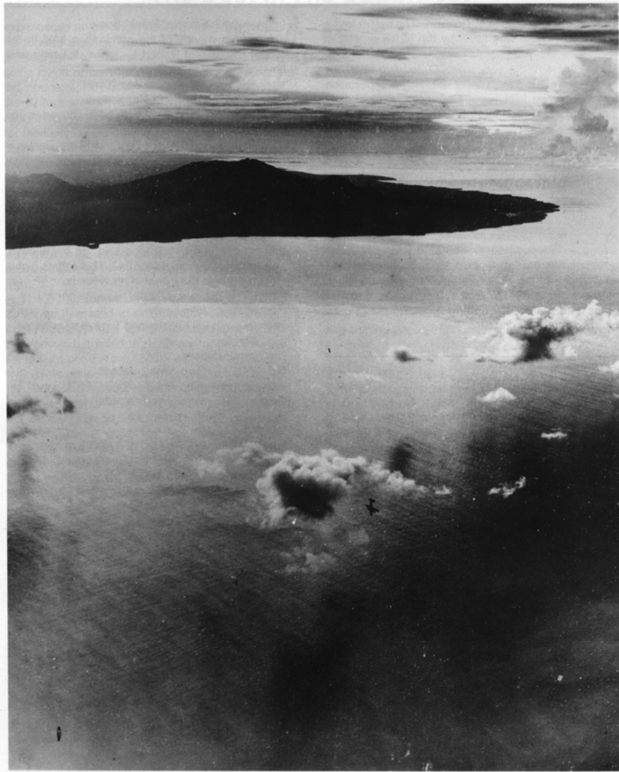
One of the truly dramatic moments in the history of the B-24 captured on film between Sakar Island and Cape Gloucester. Harold Mulhollen is in the process of safely recovering the only fully loaded B-24 known to have been successfully pulled out of a flat spin and vertical dive. It happened on 26 December 1943.