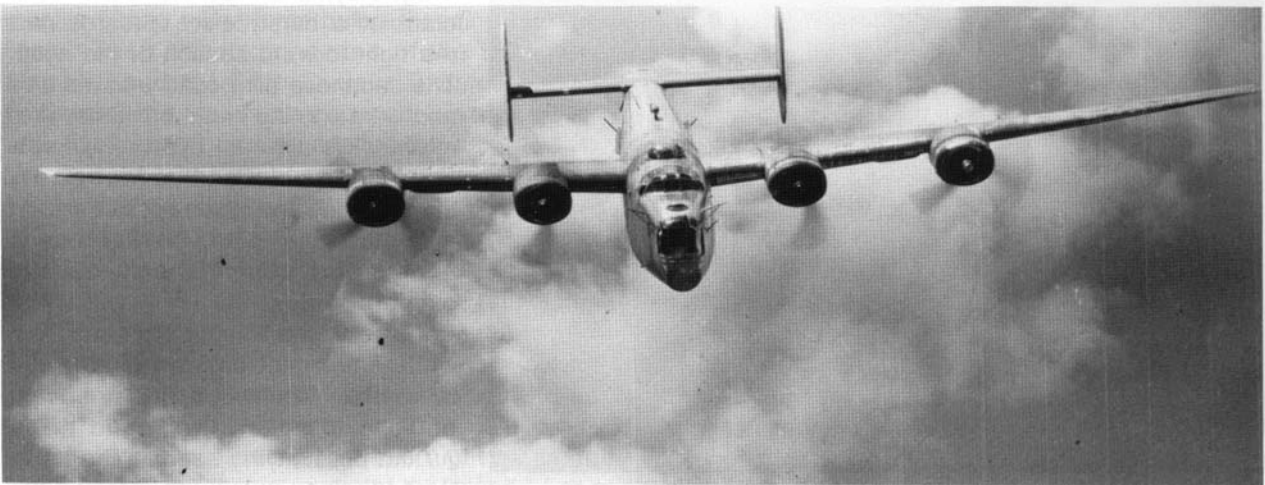
A "J" model B-24 with braced pitot tubes and hydraulic nose turret. Dexter Baker Collection

Source: Przegląd Konstrukcji Lotniczych, B-24 Liberator, p. 15, 1992, Warsaw.