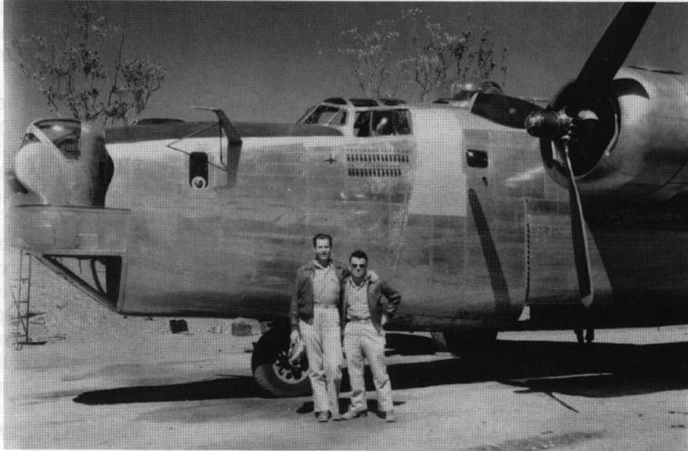
Another "J" model B-24, but this one has braced pitot tubes on both sides, no side windows to the bombardier compartment and the earlier, A6A hydraulic nose turret.