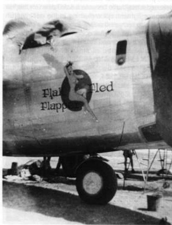
Note the lack of external nose wheel doors indicating the ship has a hydraulically powered nose turret.