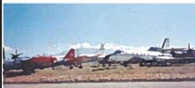
Outdoor Exhibits (Gotham)