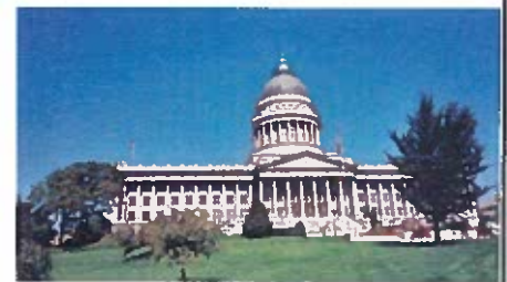
Utah Statehouse (Gotham)