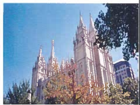
Mormon Temple (Gotham)