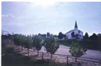
View of Chapel from Museum (Maloney)