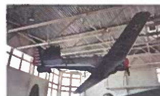
AT6 Trainer (Gotham)