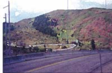
The White Curve, 2002 Olympic Site, Park City (Gerards)