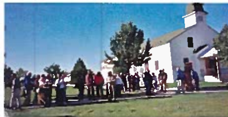
Outside the Chapel (Gotham)