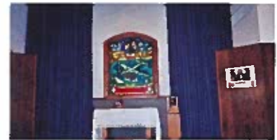
The Chapel (Gotham)