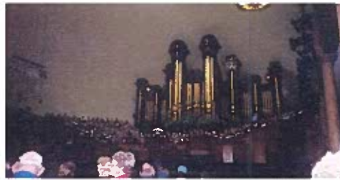
Mormon Tabernacle Choir Rehearsal (Gotham)