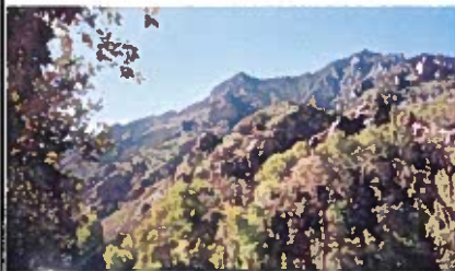
Mountains near Sundance (Gotham)