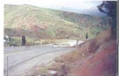
Utah Countryside (Gerards)