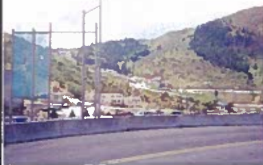
Bobsled Run, 2002 Olympic Site, Park City (Gerards)