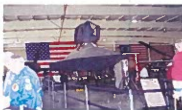
Stealth Bomber (Debevec)