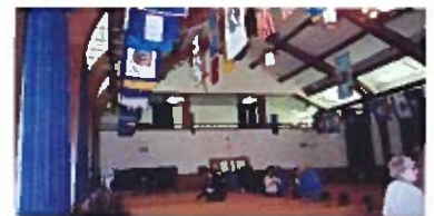
The Chapel (Gotham)