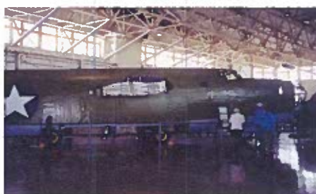
B-24 (Under Restoration) (Debevec)