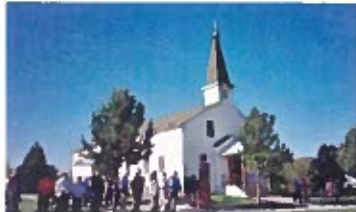
Arriving at the Chapel (Gotham)