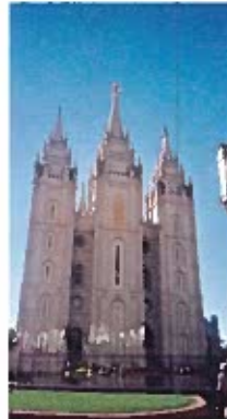
Mormon Temple (Gotham)