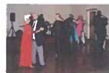
On the Dance Floor (Gotham)