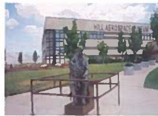
Sculpture Outside Museum Entrance (Gotham)